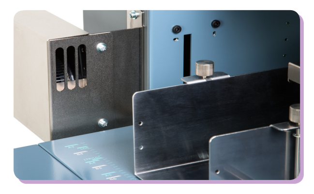
An optional Side Air Kit can be added to enhance the feeding of heavy stock and large paper sizes.

The DF-1200 comes pre-programmed with six standard fold types, making it easy to fold a wide range of applications at the touch of a button. Users can also create custom fold styles simply by moving the fold plates via the user-friendly control panel and save them in one of the 20 job memories.