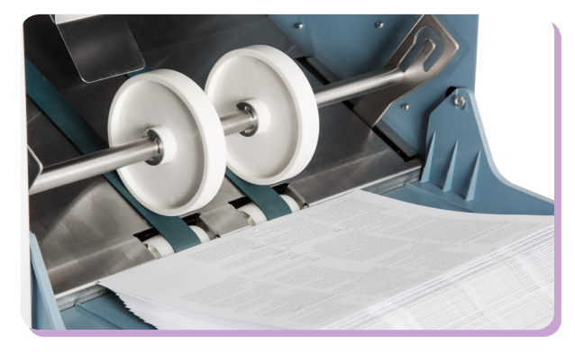
Delivery roller automatically sets paper size . Two tray positions are available for enhanced stacking.

The DF-1200 utilizes Duplo's renowned suction feed technology to handle static build-up in digital print applications and also comes equipped with Optical Double Feed Detection to ensure personalized jobs are folded one sheet at a time.