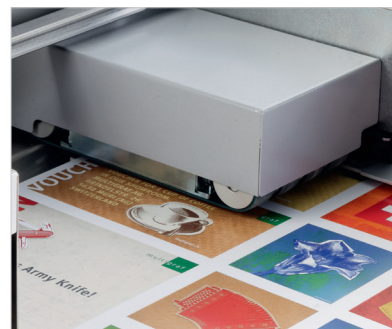
Vacuum pile feeder