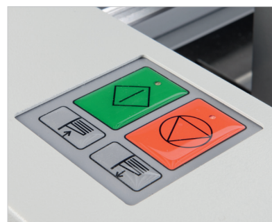
One touch operation