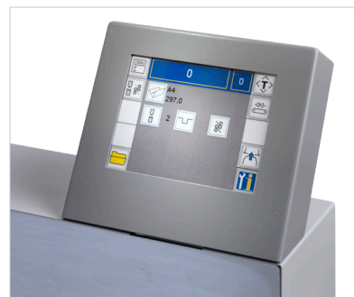
Color touch screen

Multigraf's inspiration for this new product line was given by its name - TOUCHLINE. 'Press the button and off you go!' By simply entering the sheet length and fold type through the touch screen, the machine creates all settings automatically. A centralized, multifunctional button offers all necessary functions for a fast production start.