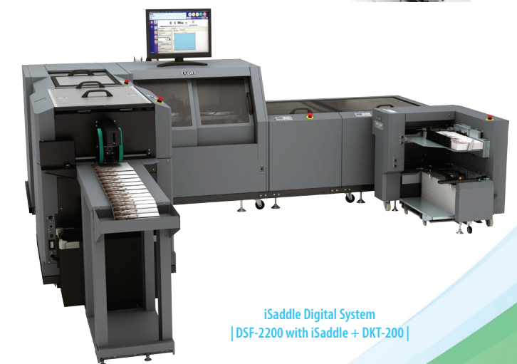
iSaddle Digital System | DSF-2200 with iSaddle + DKT-200 |