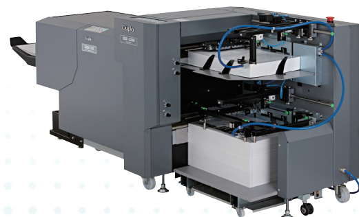
150 Digital Booklet System | DSF-2200 with DBM-150 with SxS Kit/DBM-150T |

The 150 Digital Booklet System is Duplo's entry-level sheet feeding system connecting the DSF-2200 with the DBM-150 Bookletmaker equipped with the DBM-150SxS Kit. Featuring the Isaberg Rapid stapler and staple cartridge, the DBM-150 Bookletmaker produces a high quality, flat staple every time. Each cartridge holds 5,000 staples and wear parts are replaced each time the cartridge is changed out, providing a high level of reliability. The DBM-150 Bookletmaker can be operated via the control panel where up to 16 jobs can be saved in memory or via a PC using the optional PC Controller. Compact in size yet built-in with high performance features, the 150 Digital Booklet System produces superior corner, side, or saddle-stapled applications up to 1,720 booklets per hour.