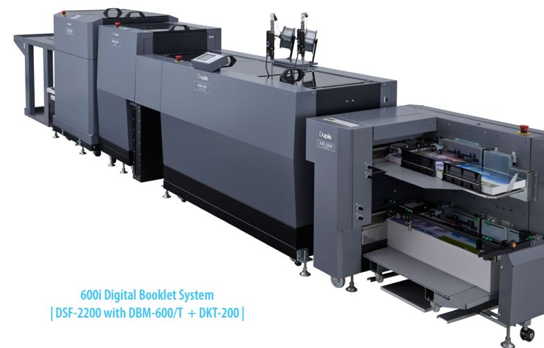
600i Digital Booklet System | DSF-2200 with DBM-600/T + DKT-200 |

350i Digital Booklet System DSF-2200 with DBM-350/T shown on cover